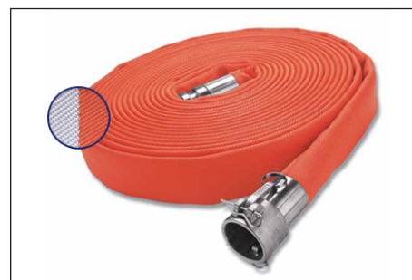
Transport hose SNOWSTORM

Available lengths: 10, 20, 30, 40, 50 and 60 m Assembly: each with 1.5", 2" oder 2.5" m/f KAMLOK couplers Colour: orange