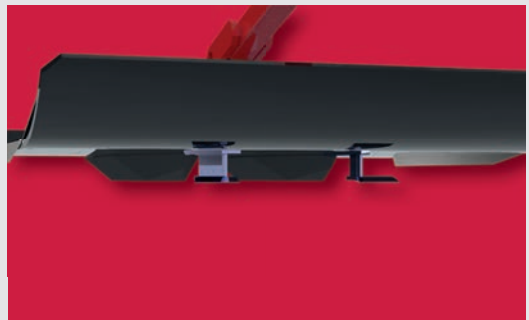
Tracksetter and steel pre-cutter