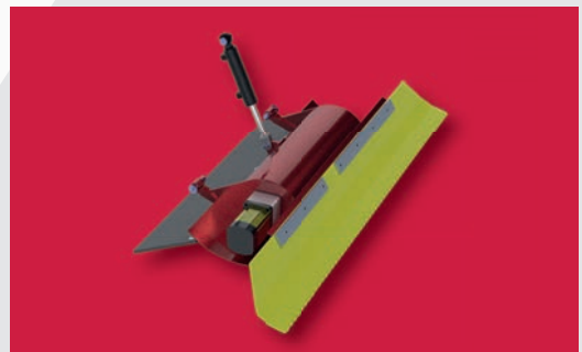
Track tiller SHARKUS